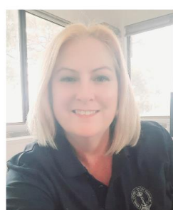
Vanessa Academy Administrator