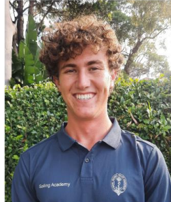
Jameson Prescott Lasers, Schools, Green Fleet, Tackers